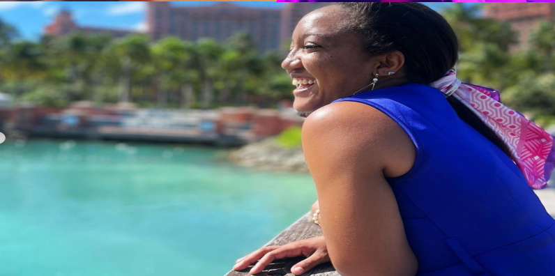
Caribbean Investment Forum, 2023