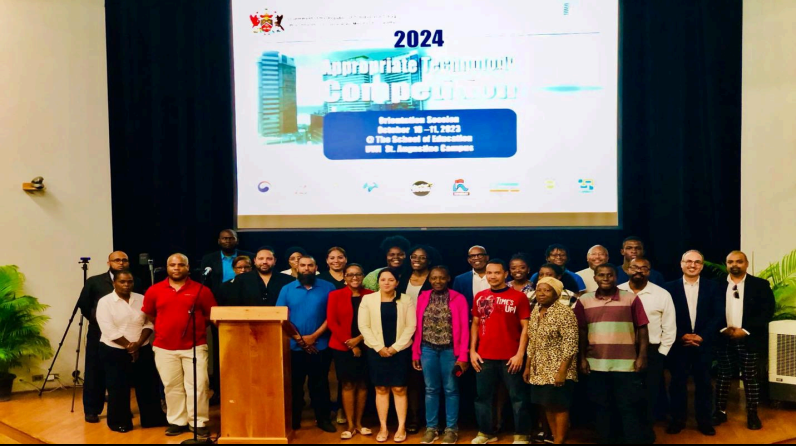
Launch of the Appropriate Technology Competition, 2023