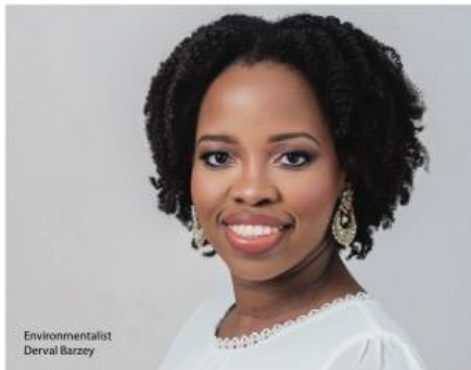
Environmentalist Derval Barzey