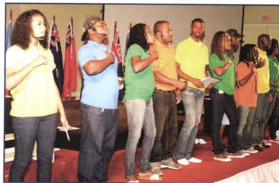
Regional youth presenting a dramatic performance of the finding of the CCYD report

their intention to, inter alia , explicitly recognise and clearly articulate the role of youth in Caribbean development in the amended Revised Treaty of Chaguaramas.