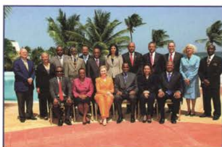
CARICOM Heads of Government and representatives of Heads of Government and His Excellency Edwin Carrington, CARICOM Secretary-General at the meeting with US Secretary of State Hillary Clinton in Bridgetown, Barbados.

In June 2010, Barbados hosted a high level consultation involving Caribbean Community Foreign Ministers and the United States of America Secretary of State, Hillary Clinton – a meeting described by Antiguan Prime Minister Honourable Baldwin Spencer as a welcome “re-engagement” with the US.