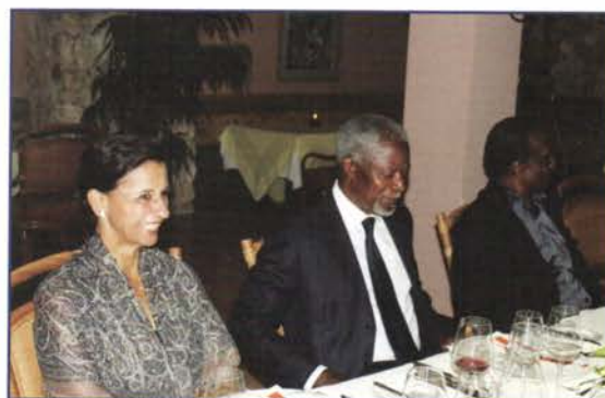
The Hon Sarah Wescot-Williams, Prime Minister of St. Maarten, former United Nations Secretary-General, Dr. Kofi Annan, and His Excellency Edwin Carrington, CARICOM Secretary-General attended the Tenth Annual General Meeting of PANCAP.

Despite many internal and external challenges, the Partnership, now in its tenth year, made significant progress in its response to the epidemic.