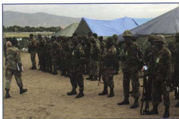
Members of the Jamaica Defence Force in Haiti shortly after the earthquake struck

The earthquake in Haiti in January roused the need for a massive regional disaster response and it was met by a tremendous outpouring of support from CARICOM Member States and Associate Members beginning with Jamaica - the sub-regional focal point for that area for the Caribbean Disaster Emergency Management Agency (CDEMA) - leading the charge within the first 48 hours of the disaster, outfitted with military, medical, search and rescue personnel and relief supplies.