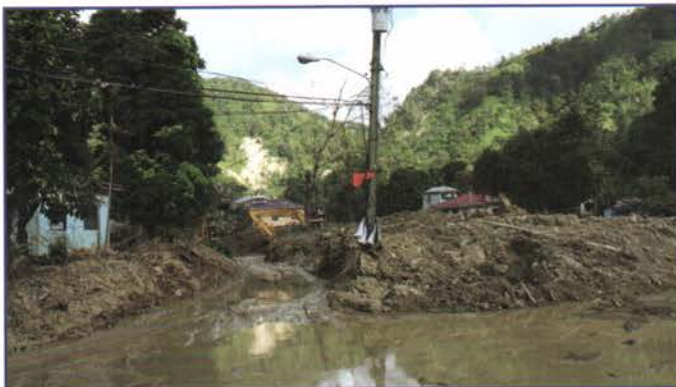
Hurricane Tomas damage

As far as other natural disasters go, the Region was generally spared during the hurricane season, except for the destruction wrought by Hurricane Tomas particularly in Barbados, Saint Lucia and St. Vincent and the Grenadines. Saint Lucia was the worst affected. Tomas struck that Member State on October 30 and battered the south of the island killing at least eight people and wreaking considerable damage estimated at US$500 million, particularly through land and mudslides that felled trees, swept houses off their foundations and buried others, blocked rivers and bridges and made main roads impassable.