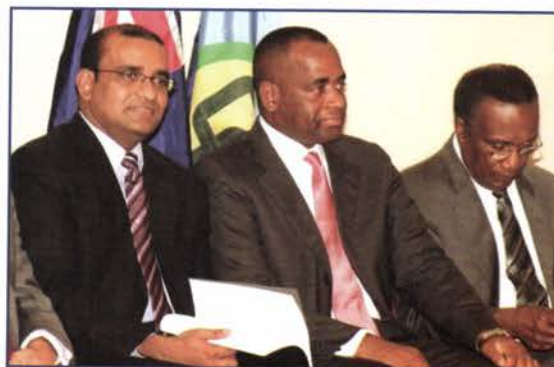
Members of the Bureau of CARICOM Heads of Government: (L-R) HE Bharrat Jagdeo, Immediate Past Chair of Conference; Hon Roosevelt Skerrit, Chairman of Conference; HE Edwin Carrington, CARICOM Secretary-General.

The Commission's Report became available in Dutch and French, in May 2010, through the work of the Suriname-based Caribbean Regional Information and Translation Institute (CRITI).