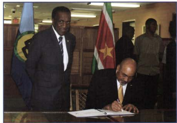
His Excellency Desi Bouterse, President of the Republic of Suriname, signs the visitors' book at the CARICOM Secretariat as His Excellency Edwin Carrington, CARICOM Secretary-General looks on.

In 2010, two Heads of Government were re-elected - the Hon. Dr. Denzil Douglas, Prime Minister of St. Kitts and Nevis, and Dr. the Hon. Ralph Gonsalves, Prime Minister of St. Vincent and the Grenadines. Two new leaders, the Hon. Kamla Persad-Bissessar, Prime Minister of Trinidad and Tobago, and His Excellency Desi Bouterse, President of the Republic of Suriname, took their place within the Conference of Heads of Government, after winning the mandates of their people. The Hon. Freundel Stuart, was appointed Prime Minister of Barbados following the death of the Hon. David Thompson.