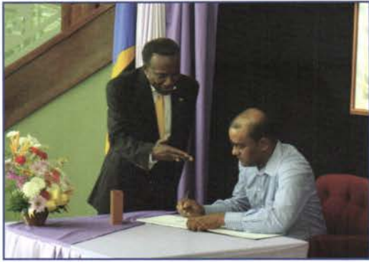
His Excellency Bharrat Jagdeo, President of the Republic of Guyana signs the Book of Condolence opened at the CARICOM Secretariat following the death of the Hon David Thompson, Prime Minister of Barbados.