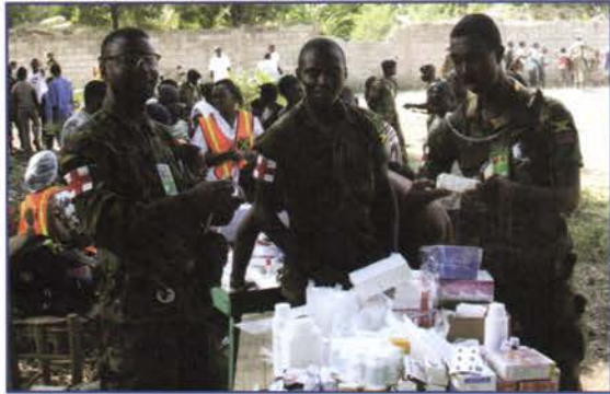
JDF Medical Corps attending to the injured in Haiti

operationalised on the ground, the CARICOM Heads of government were mobilising political support for sustained recovery and reconstruction efforts in the earthquake-torn French-speaking CARICOM Member State.