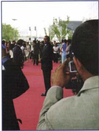
His Excellency President Bharrat Jagdeo, who headed the CARICOM delegation to the Shanghai Exposition, on the red carpet for CARICOM National Day observances in July 2010

Foundation - to promote social development within the Caribbean and Latin America.