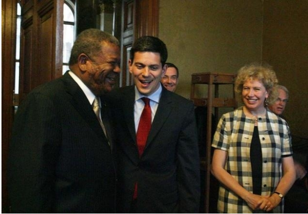
Honourable Baldwin Spencer Prime Minister and Minister of Foreign Affairs of Antigua and Barbuda, shares a joke with Rt Honourable David Milliband Foreign Secretary of Great Britain as Parliamentary UnderSecretary of State for Foreign and Commonwealth Affairs Honourable Meg Munn looks on, at Lancaster House, London, July 2008