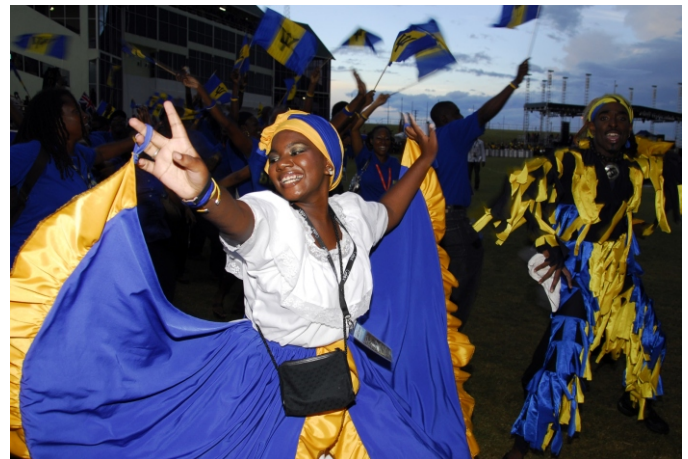
Barbados enters the Guyana National Stadium on opening night of CARIFESTA X

Children and education were the themes of two Meetings of the Council for Human and Social Development (COHSOD). At the Twelfth Special Meeting of COHSOD in March 2008 which focused on children, one of the major recommendations was the lowering of the age of universal compulsory education across the Region to four years to ensure that all children receive at least one year of formal early childhood exposure, prior to entry into primary school. At the conclusion of that meeting, a declaration was issued titled 'The Georgetown Declaration on Building a Region Fit for Children For the survival, development, protection dignity, and participation of Children within the Caribbean'. The Seventeenth Meeting of the COHSOD in November 2008 evaluated the progress the Community had taken in education over the past ten years.