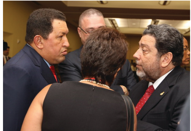
Dr. The Hon. Ralph Gonsalves, Prime Minister of St. Vincent and the Grenadines, (right) and The Hon. David Thompson, Prime Minister of Barbados (partly hidden) with President Hugo Chavez of Venezuela at the Summit of the Americas in Trinidad and Tobago in April 2009.