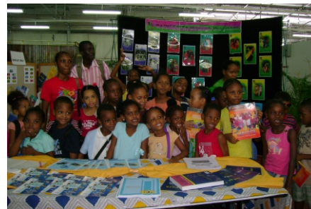
Patrons flock the CARICOM Secretariat booth at the Grand Market