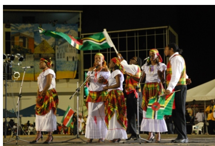
Dominicans perform at CARIFESTA X closing ceremony