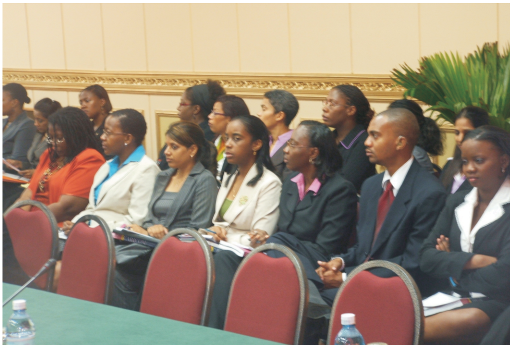
Students of the University of the West Indies Cave Hill Campus at the 26th meeting of the Council for Trade and Economic Development in Georgetown, November 2008

Given the impacts on the global economic crisis, in 2008, a study was conducted by the IATA - with the support of the Caribbean Development Bank - to look into the costs of air travel in the Caribbean Region. A Draft Final Report was submitted to the COTED and other Stakeholders.