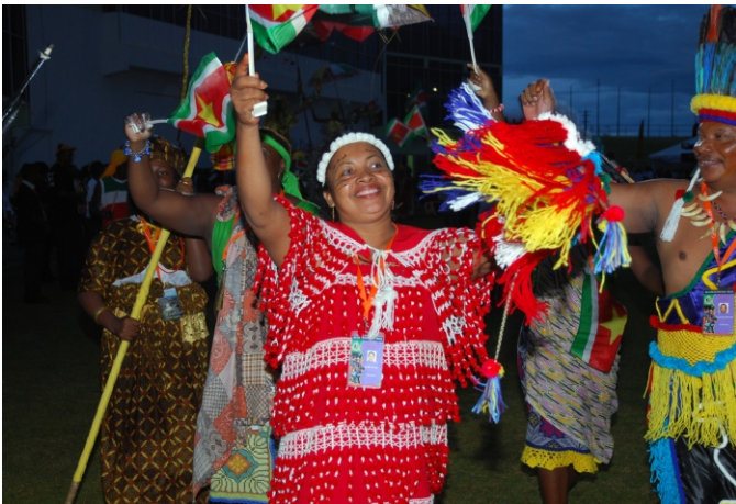
Suriname enters the Guyana National Stadium on opening night of CARIFESTA X

The riot of colour and vibrancy and depth that characterize Caribbean culture were on display at CARIFESTA X, successfully staged in Guyana under the theme ' One Caribbean, One Purpose, Our Culture, Our Life '. CARIFESTA X marked the second occasion on which Guyana hosted the Region's mega event. The first CARIFESTA in 1972 was held in Georgetown.