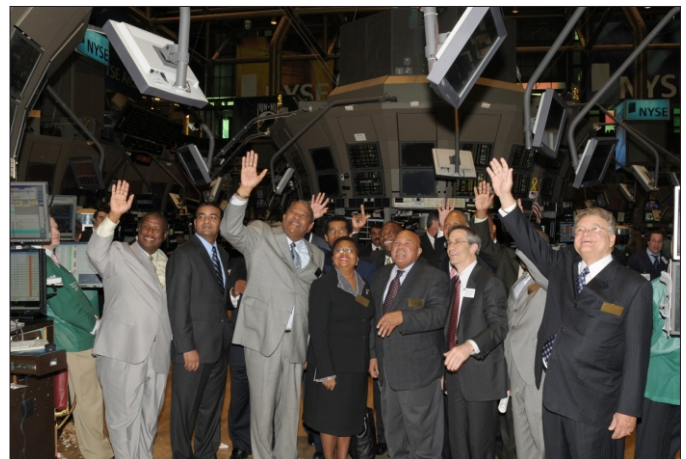
CARICOM Heads of Government and DSG at the New York Stock Exchange - 20 June 2008

Demonstrating its commitment to partner with CARICOM, the Federal Republic of Germany entered into a Financing Agreement with the Community worth eight million Euros, in February 2008, to support the work of the Pan Caribbean Partnership Against HIV/AIDS in the Caribbean. The grant was to be disbursed in two tranches, the first of five million and the second of three million.