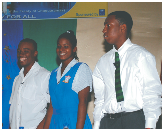
Students participating in the CARICOM Quiz 2008

The second biennial Community-wide CARICOM Regional School Quiz was staged successfully in 2008. In keenly contested finals between St. Kitts and Nevis and Saint Lucia in Antigua and Barbuda, St. Kitts and Nevis emerged as the champion of the Competition. Scotia Bank provided the champion's trophy and a cash award of US$1000, among other prizes.