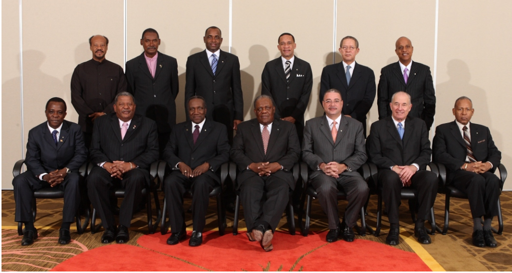
Heads of Government and Delegations 19th Intersessional Nassau, The Bahamas, March 2008

Seated from left : Dr the Honourable Keith Mitchell (Grenada); Honourable Baldwin Spencer (Antigua and Barbuda); His Excellency Edwin Carrington (Secretary-General CARICOM), Rt Honourable Hubert Ingraham (The Bahamas); Honourable David Thompson (Barbados) His Excellency Donald McKinnon (Secretary-General of The Commonwealth); Honourable Patrick Manning (Trinidad and Tobago)