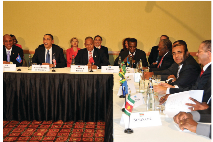
CARICOM Heads of Government met with United States President Barack Obama on the margins of the Summit of the Americas in Trinidad and Tobago in April 2009

Relations with Overseas Countries and Territories (OTCs) were strengthened with visits by the CARICOM Secretary-General to the Netherland Antilles in 2008.