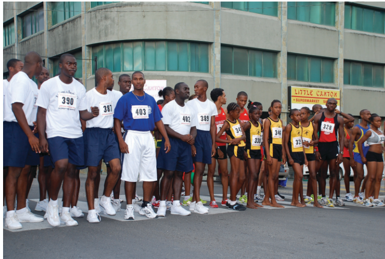
Runners at the start of the Annual 10K race in St. John's in 2008