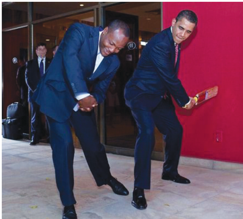
President Barack Obama receiving a few batting tips from former West Indies cricketer Brian Lara, April 2009

Both RIBN and the RIMS were structured to bolster investigative and prosecutorial capacity in the Region, ultimately supporting Law Enforcement. The RIBN, in particular, will facilitate the sharing of intelligence across jurisdictional boundaries. It will enable national and regional Law Enforcement agencies to overcome the obstacles and delays associated with the logistics of physical evidence exchange and give them the tools to discover and analyse links between crimes, guns and suspects.