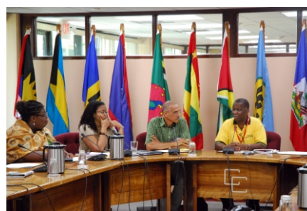
Directors of Culture and Contingent Leaders met on the margins of CARIFESTA X

The work of a Task Force on Cultural Industries moved apace in 2009. Among its accomplishments were the facilitation of a survey on incentives for the development of cultural industries in six Member States; and consideration of draft reports on best practices in governance related to the development of cultural industries. The Task Force was launched on 23 October 2008. Its establishment was aimed at facilitating the development of a comprehensive Regional Policy Framework and Action Plan for cultural industries in CARICOM and was mandated by both the COTED and the Council for Human and Social Development (COHSOD).