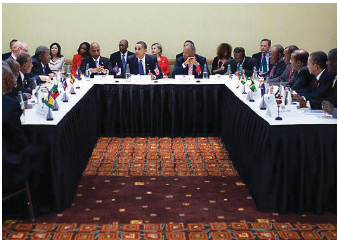
CARICOM Heads of Government in discussion with US President Barack Obama on the margins of the Fifth Summit of the Americas in Trinidad and Tobago in April 2009

In 2009, the Heads of Government continued the punishing pace they had adopted in 2008 with a series of activities region-wide and extra-regionally which required their presence in the main to consolidate relations within the Community and to forge and strengthen ties with third states.