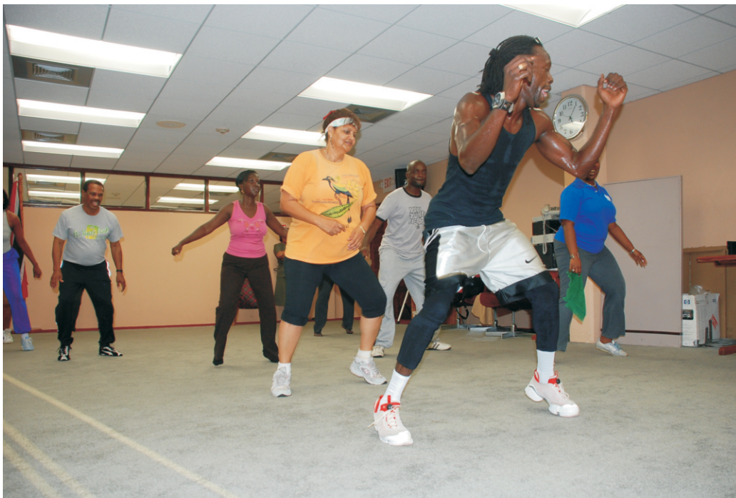
Caribbean Wellness Day fitness session at the CARICOM Secretariat

CARICOM Heads of Government at the Thirtieth Meeting of the Conference of Heads of Government, in Georgetown, Guyana, July 2009, considered a regional protocol to deal with the Influenza A H1NI virus . They acknowledged the effectiveness of the response so far, including a Cruise Ship Protocol.