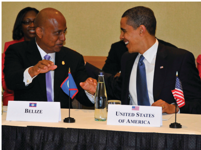
The Hon Dean Barrow, Prime Minister of Belize shares a light moment with President Barack Obama of the United States of America at a meeting on the margins of the Summit of the Americas, in Trinidad and Tobago, April 2009.