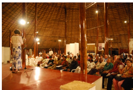
Book readings at the Umana Yana were among the features at CARIFESTA X