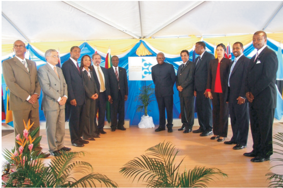
His Excellency Drs Runaldo Venetian, President of the Republic of Suriname and His Excellency Edwin Carrington, CARICOM Secretary-General with members of the CARICOM Competition Commission and other dignitaries at the launching ceremony in Paramaribo, Suriname

An integral part of the operations of the CSME, the CARICOM Competition Commission, was launched on 19 January, 2008 in Suriname. The Competition Commission was established to prevent attempts at preserving positions in national markets by frustrating competition. Measures were also taken to establish a Sub-Regional Competition Commission of the OECS with the preparation of an operational budget.