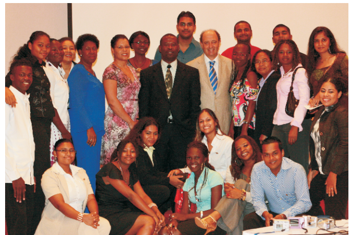
The group of tertiary students from Suriname on CSME study tour

The CSME study tours that began in 2008 under a project titled ' Students engaging the CSME through Field Promotion ', continued in 2009, when more than 200 students from tertiary institutions in Trinidad and Tobago, Jamaica, Antigua and Barbuda, Saint Lucia and St. Vincent and the Grenadines, Grenada, Guyana, Barbados and St Kitts and Nevis travelled to various other Member States and were exposed to the operations of the CSME.