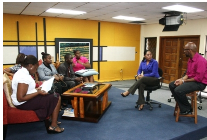
Youths participate in one of the outreach sessions organized by the CSME Unit