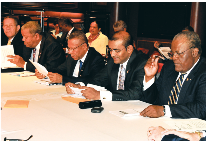
CARICOM Heads of Government at the Summit of the Americas in April 2009 in Trinidad and Tobago. From left are the Hon Bruce Golding, Prime Minister of Jamaica, the Hon. Baldwin Spencer, Prime Minister of Antigua and Barbuda, the Hon Tillman Thomas, Prime Minister of Grenada, His Excellency Bharrat Jagdeo, President of Guyana, the Hon. Hubert Ingraham, Prime Minister of the Bahamas

Following up on the Fifth Summit of the Americas, the CARICOM Foreign Ministers met US Secretary of State Hillary Clinton in New York in September 2009. That meeting provided an opportunity for discussions on matters arising from the meeting between CARICOM Heads of Government and President Obama and a previous meeting between the Ministers and Secretary of State Clinton in Honduras in June 2009, during the Organisation of American States General Assembly. At the meeting in New York, Secretary of State Clinton was informed of CARICOM's concerns with regard to the increase in drug and arms trafficking in the Caribbean