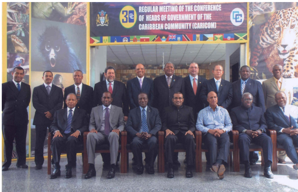
Heads of Government and Delegations 30th Meeting of the Conference of Heads of Government, Georgetown, Guyana, July 2009